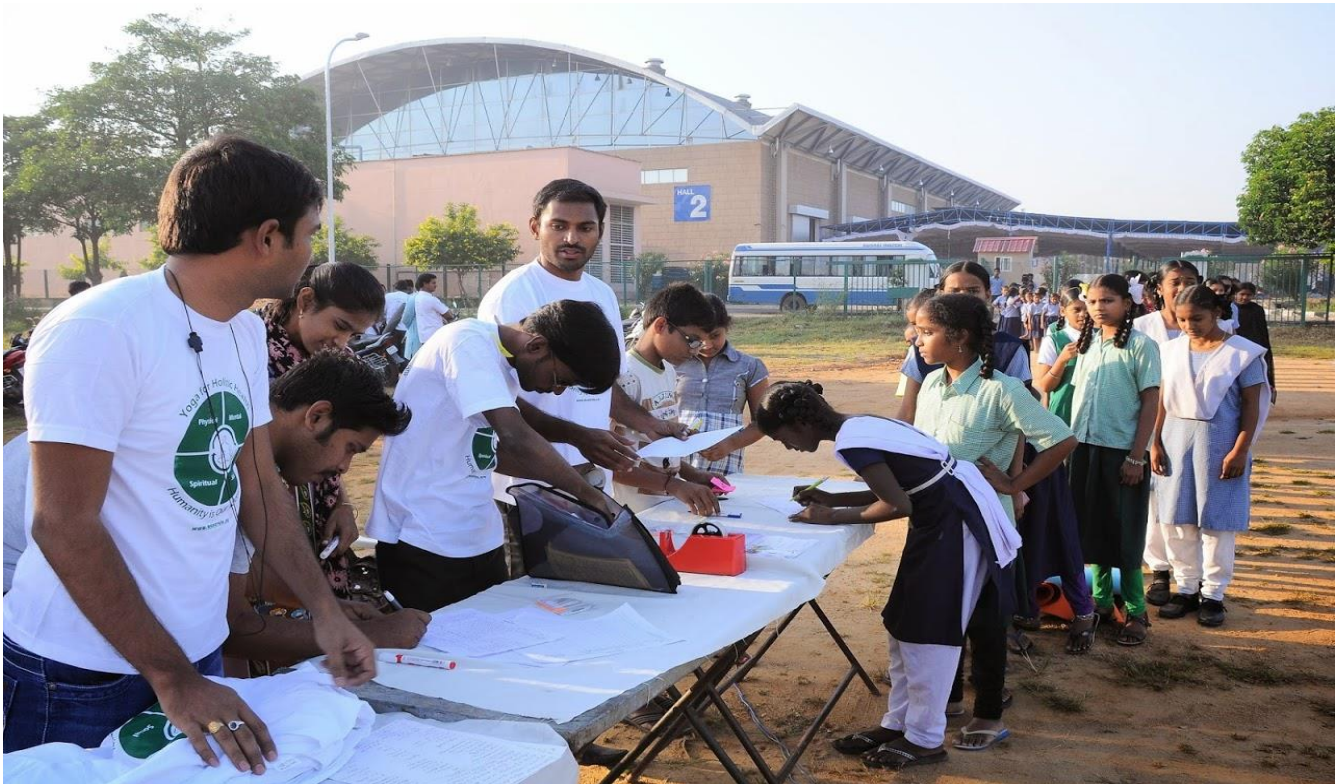
Registrations for Yogathon-2013 @ Hitex Grounds

Around 25 school children, college students, corporate employees and others were participated in the 108 Surya Namaskars Competition and this workshop enthusiastically.