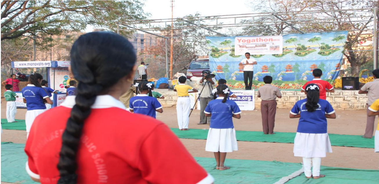
Explaining the benefits of Surya Namaskaras and Yogasana

Our Mission is to Create a Healthy, Happy and Harmonious (3H) World