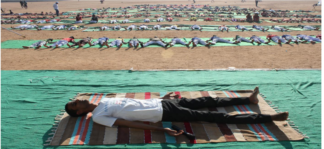
Relaxing in Shavasana