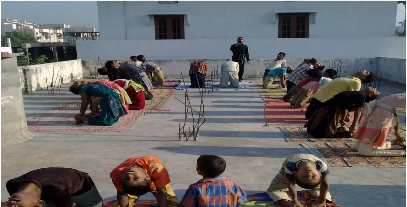
Yoga practice has been shown to improve several aspects of mental health in normal children.